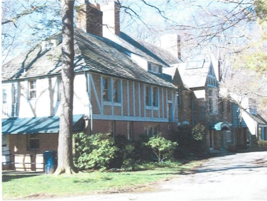
Wild Acres, north facade