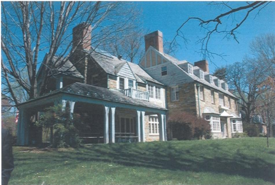
Wild Acres, south facade