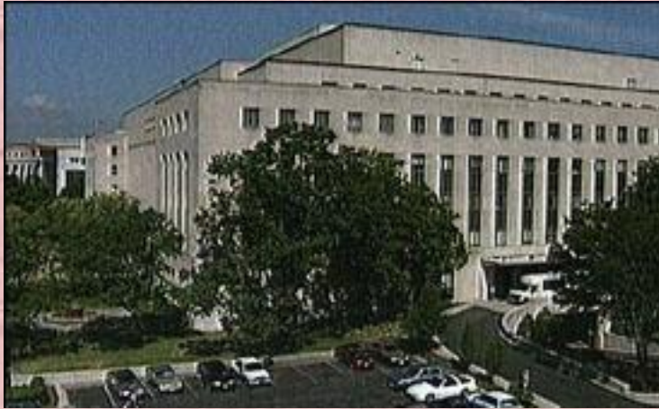
E. Barrett Prettyman Federal Courthouse, 1952