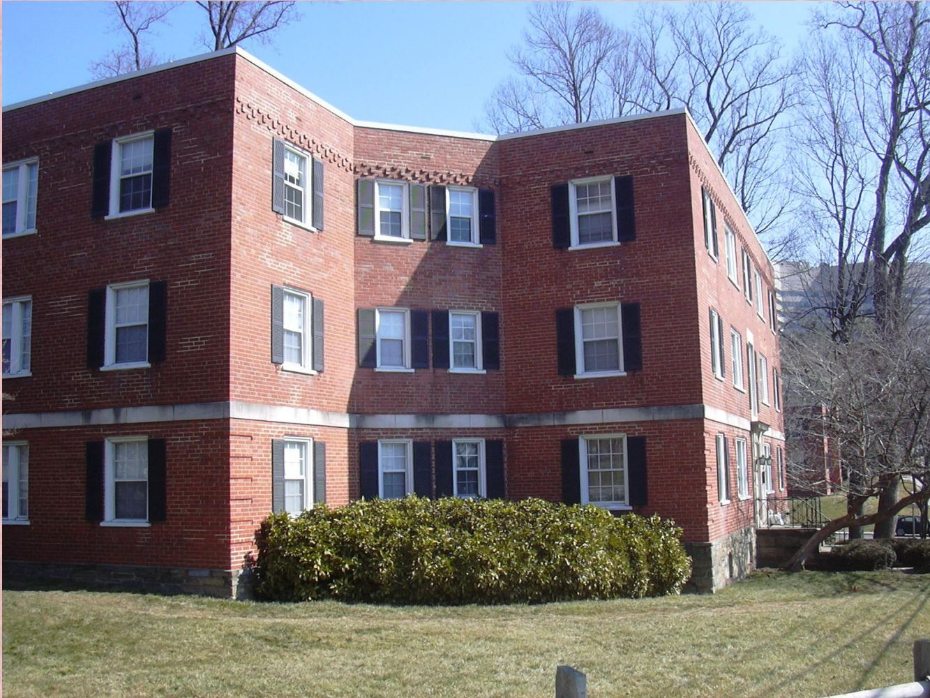
North Parcel, 16 th and East-West Highway