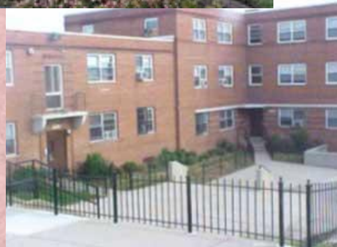
Fort Dupont Dwellings, pre-1946