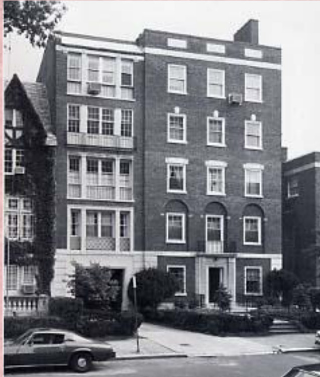
2120 Kalorama, 1925