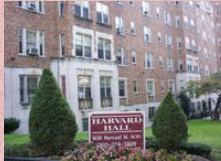
Harvard Hall, 1928