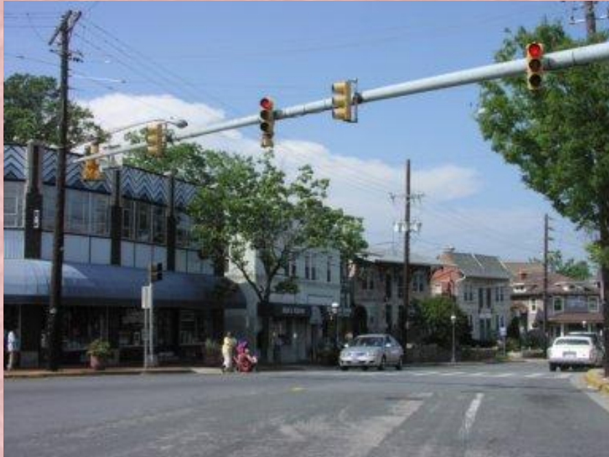
Takoma Park Downtown