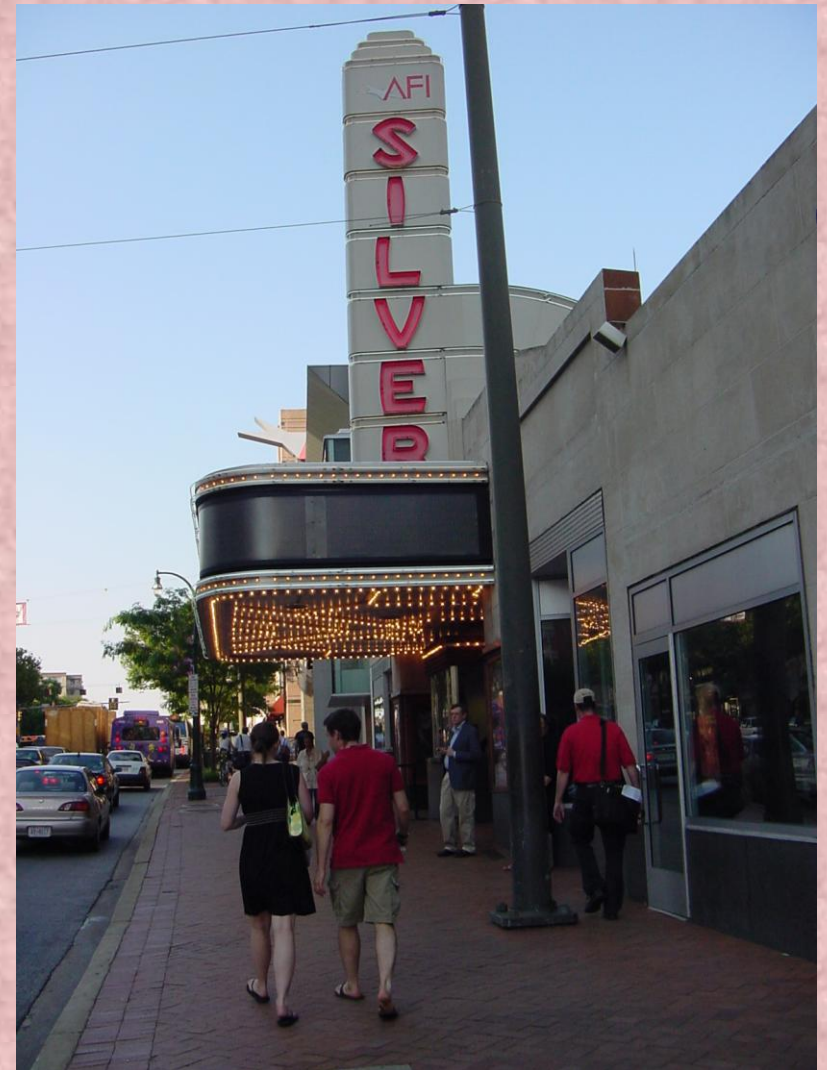
Silver Theatre & Shopping Center