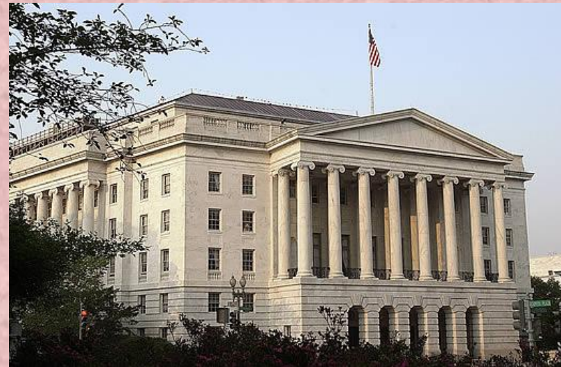
Longworth House Office Building, 1933