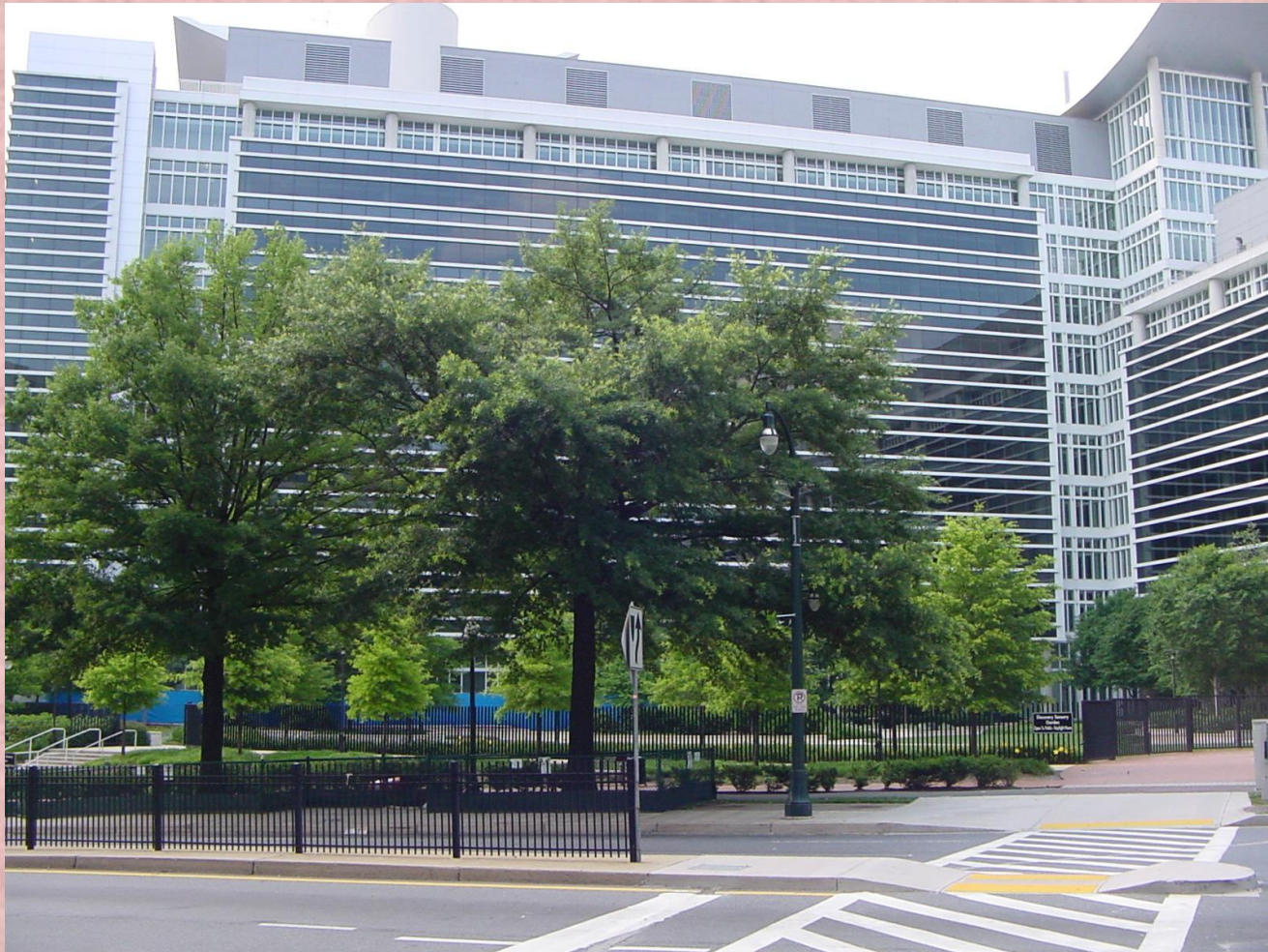
Discovery Building, downtown Silver Spring