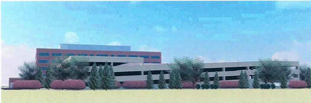
Rendered North Elevation (Parking Garage)