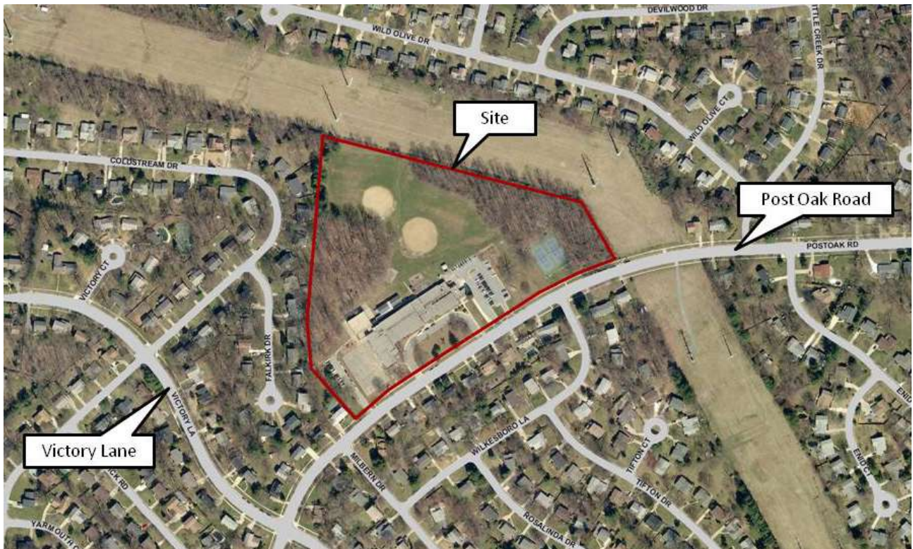
Figure 1: 2010 Aerial Photograph