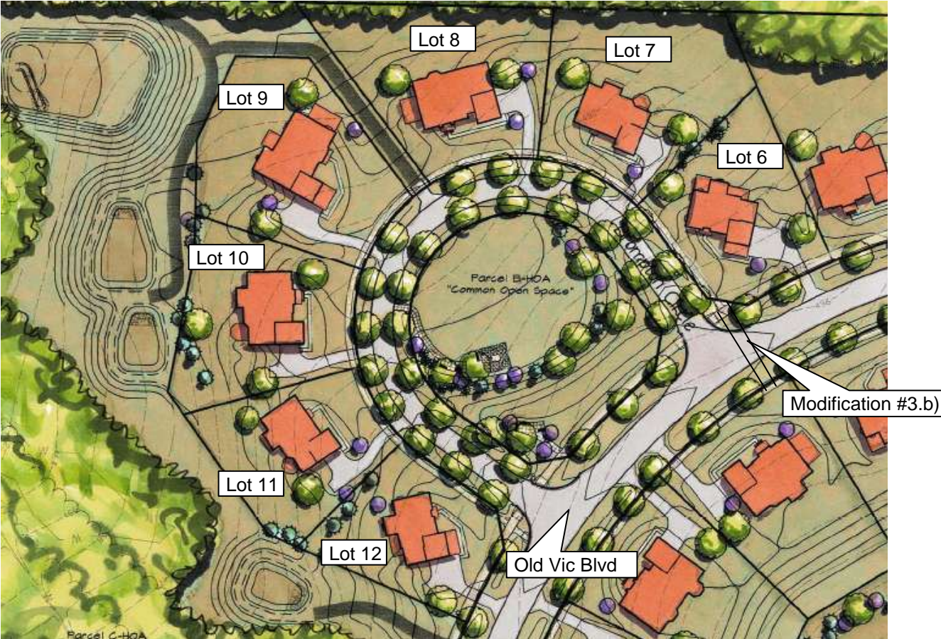
Figure 4: New lot configuration for Brompton Circle (formerly labeled as Street 'A')