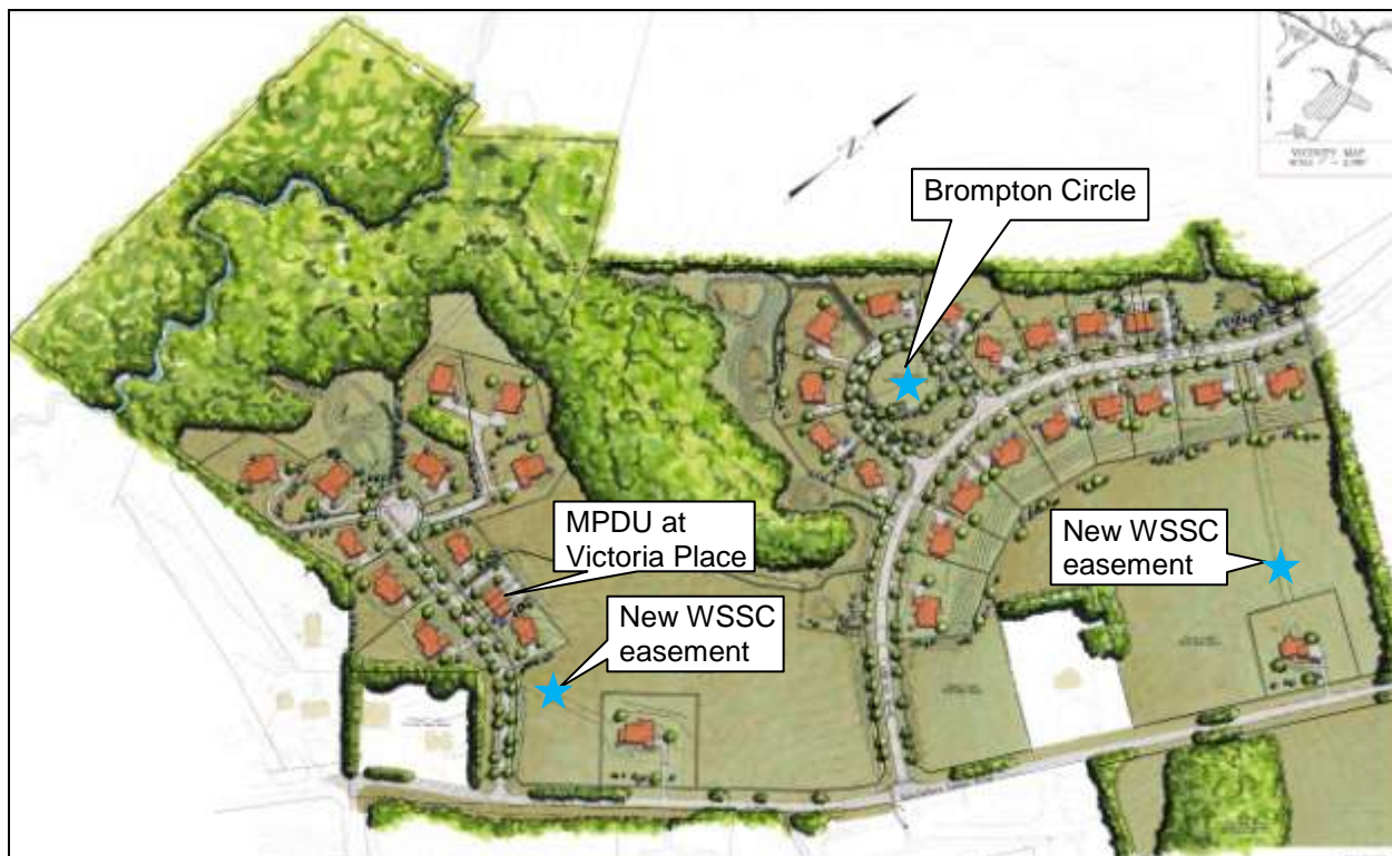
Figure 3: Overall Plan with amendment areas labeled

The Applicant requests the following modifications to the Site Plan: