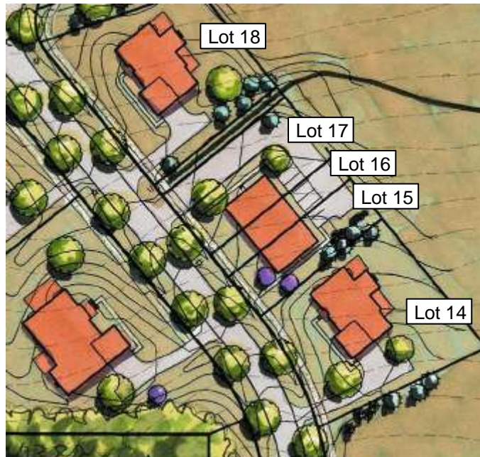
Figure 5: Additional MPDU on Victoria Place