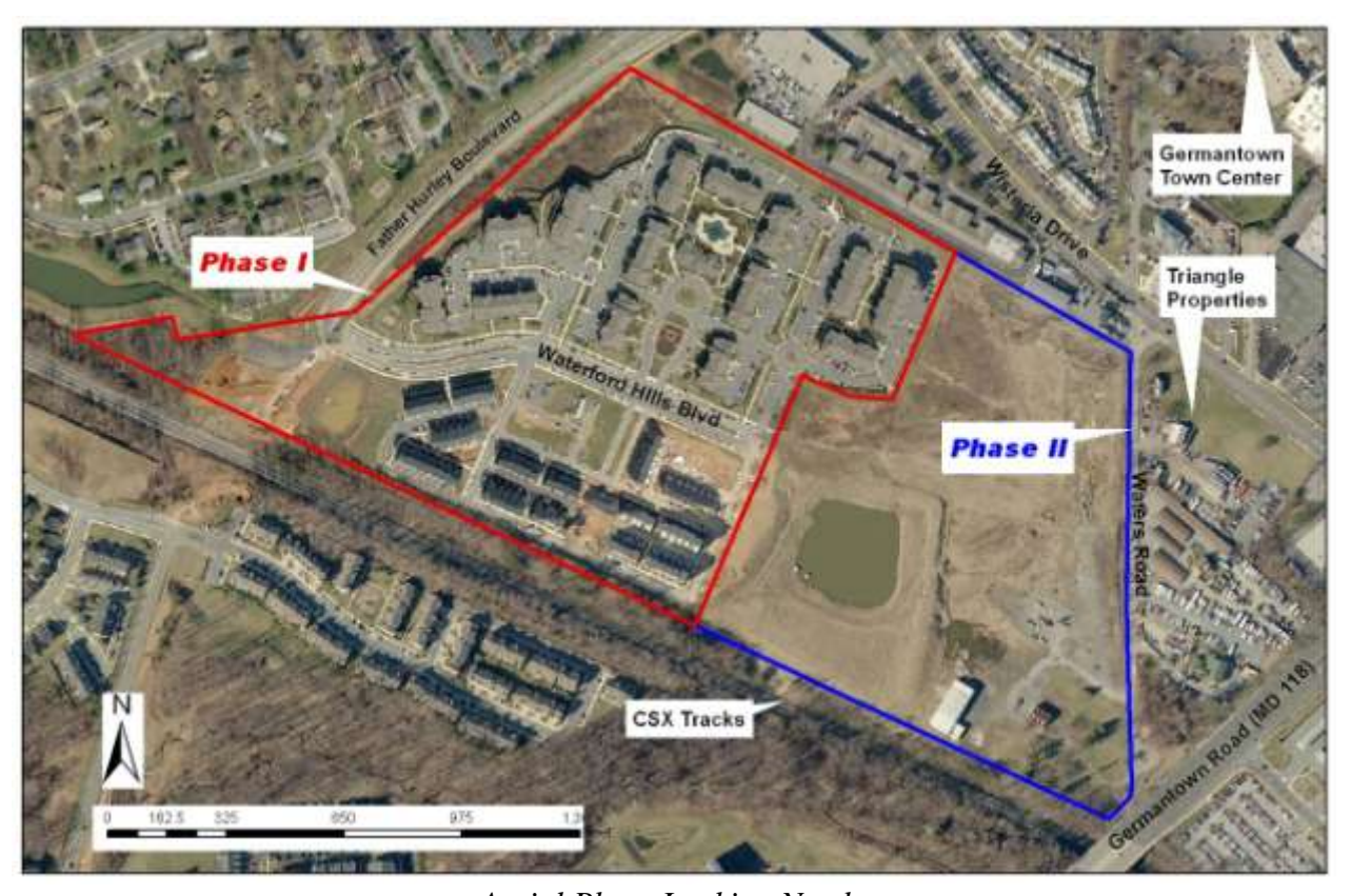
Aerial Photo Looking North

There are no known rare, threatened, or endangered species on site. There are no known historic properties or features on site. The property is within the Little Seneca Creek watershed; a Use III-P watershed. The Countywide Stream Protection Strategy (CSPS) rates streams in this watershed as fair.