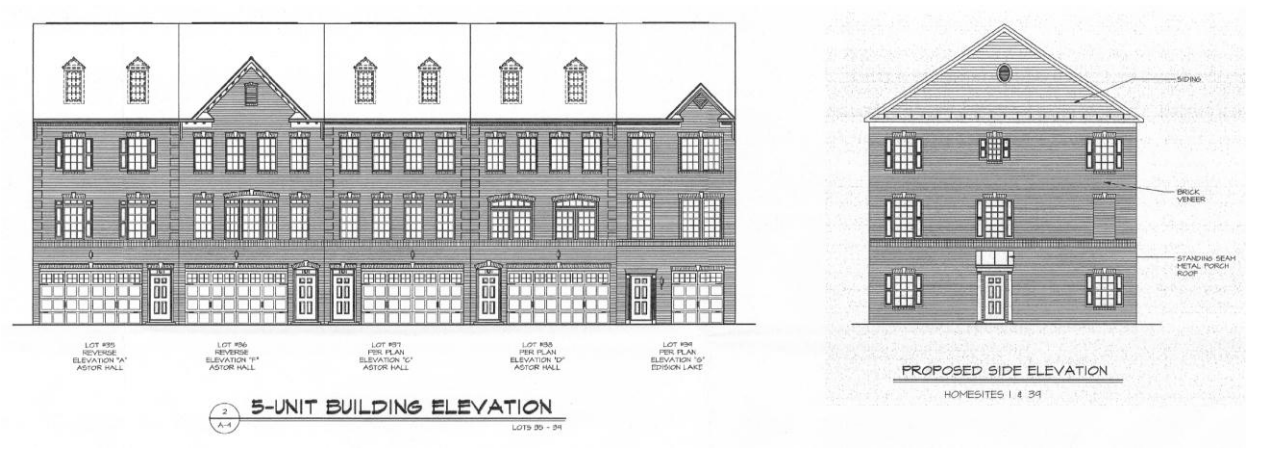
Previously Approved Façade Illustration