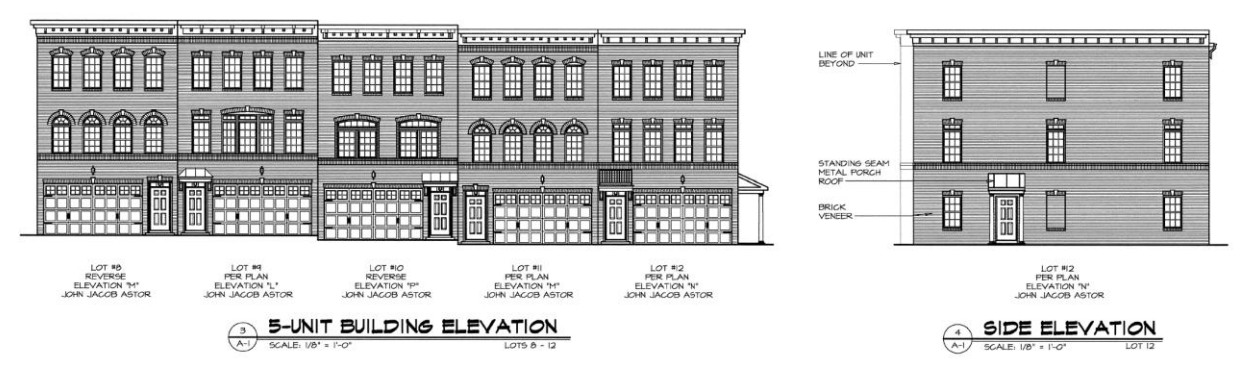
Proposed Façade Illustration