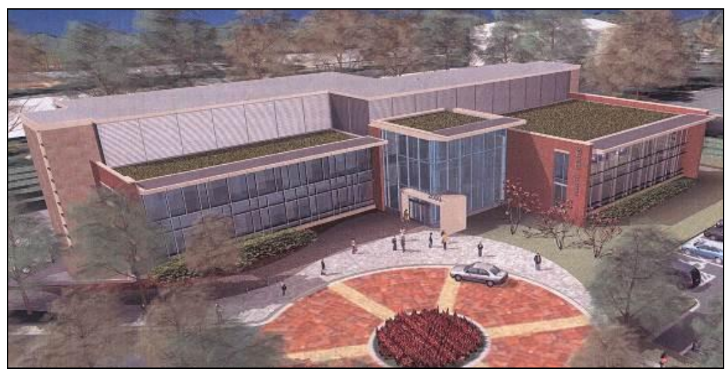
Figure 2: Proposed north face of the project