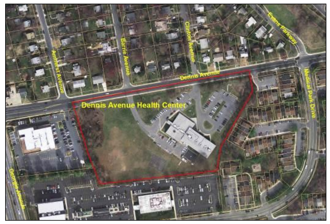
Figure 2: Existing Site Aerial

The subject property is located along Dennis Avenue, east of Georgia Avenue (MD 97) just south of the Wheaton Sector Plan Area. The site is bordered by single-family attached homes along the eastern property line with single-family detached homes facing the property across Dennis Avenue. To the south and west are three medical office buildings with surface parking lots. The site is located in the 1989 Master Plan for the Communities of Kensington-Wheaton area and zoned R-60.