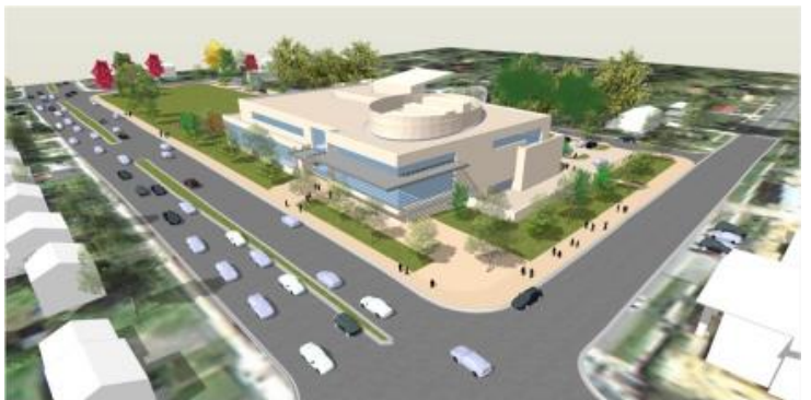
Option C: Maintains front edge, largest green area, limited foot print