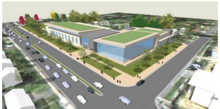
Option A: Preferred DGS option with a strong urban edge, green area, and mid-block entry on the front and back.