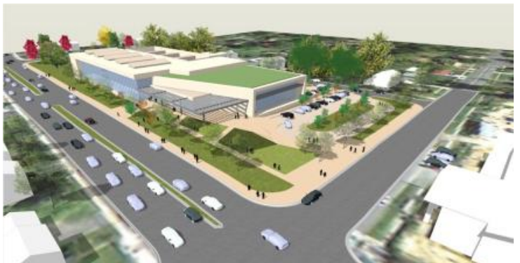
Option B: Front plaza, one front door, clear entry, green area.