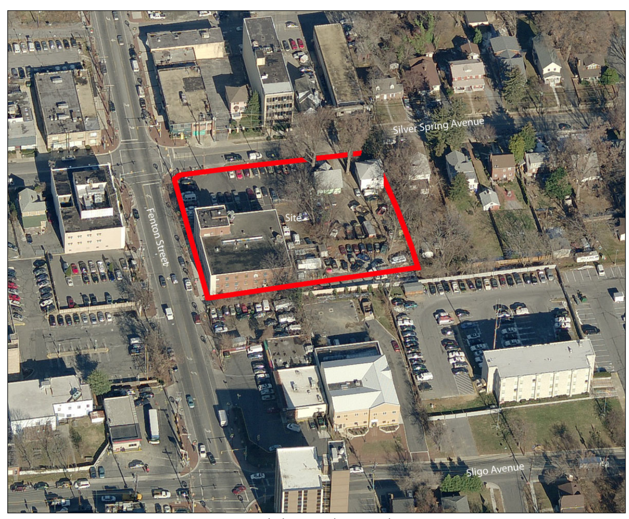
Aerial Photo Looking North

The subject property is located in the Fenton Village section of the Silver Spring CBD, on the southeast quadrant of the intersection of Fenton Street and Silver Spring Avenue. The uses along Fenton Street are primarily commercial, and include a supermarket, convenience retail, small office buildings, restaurants, and a gas station in the CBD-1, CBD-0.5, and Fenton Village Overlay zones. Although there is one