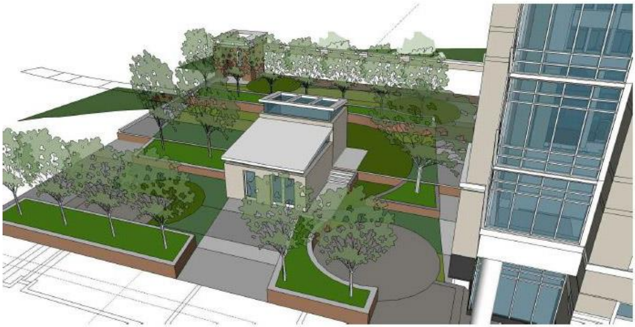
Image 4 & 5: Park Potomac Avenue streetscape and Building D green roof.

The placement of street trees and understory plantings along Park Potomac Avenue provides shade for outdoor seating areas, efficiently increases the overall tree canopy and provides a safe landscaped buffer for pedestrians. The green roof on Building D is a