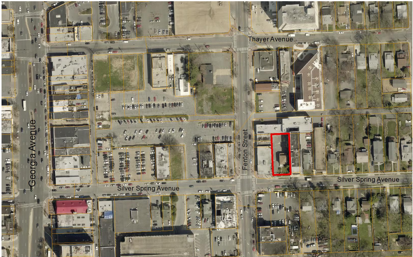
Figure 2-Aerial View