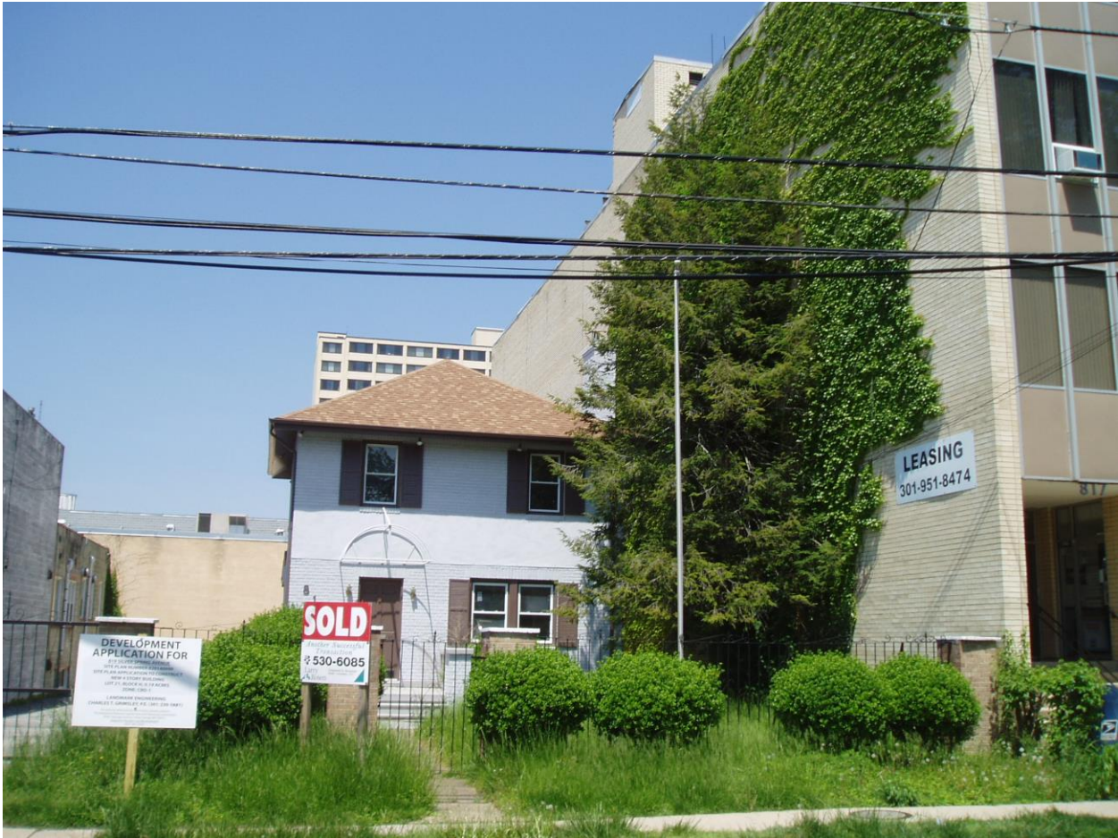
Figure 3- North facing photo of site from Silver Spring Ave.