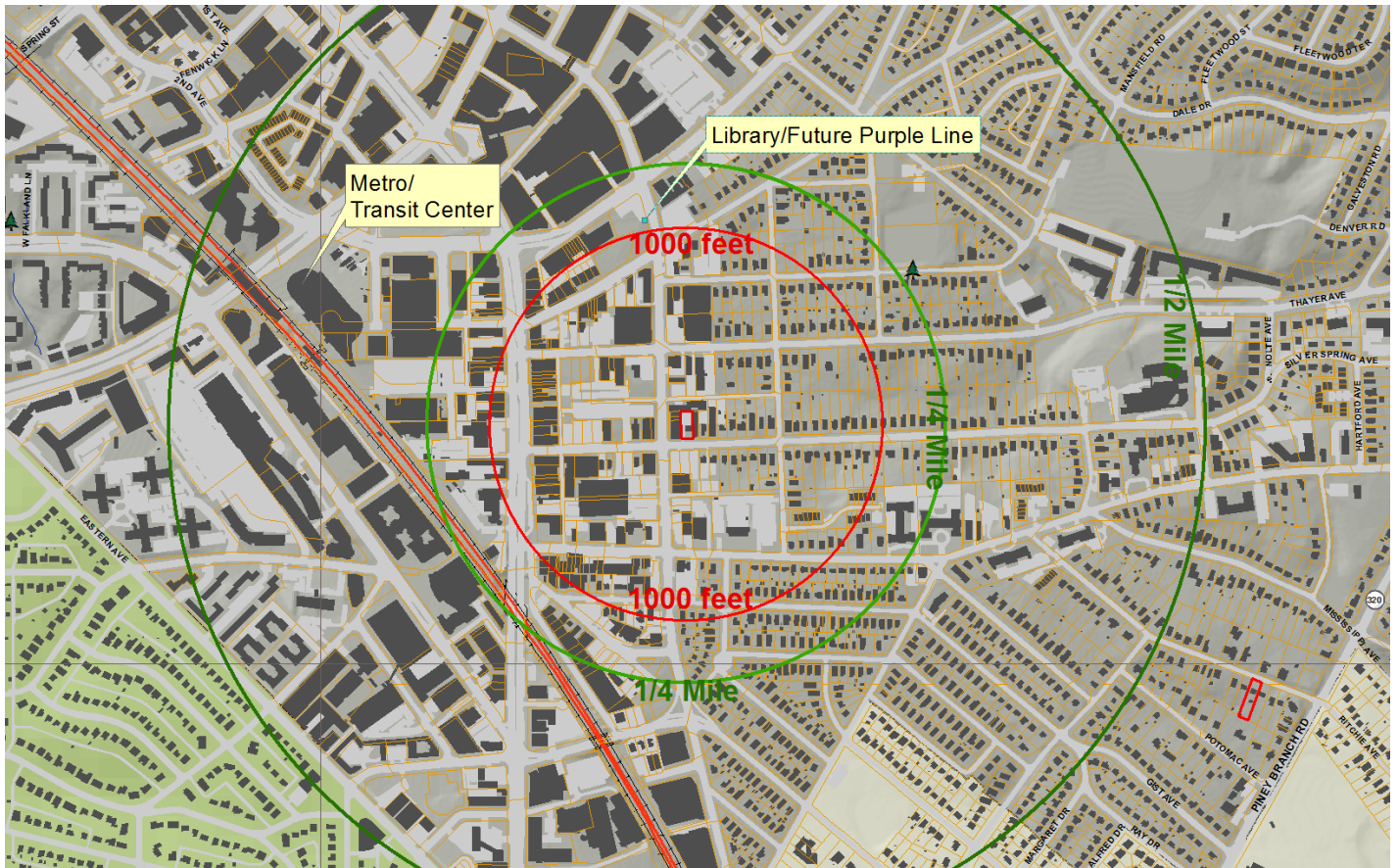
Figure 1-Vicinity Map

The subject site (Subject Property or Property) comprises of one recorded lot, located at 819 Silver Spring Avenue, on the north side Silver Spring Avenue, approximately 60 feet east of the intersection with Fenton Street. It is located in the 2000 Silver Spring CBD Sector Plan (Sector Plan) area, on the eastern edge of the CBD. The site is also within the Fenton Village Overlay Zone. The Subject Property is within ¼ mile of a master-planned Purple Line station entrance and less than ½ mile from the existing Silver Spring Metro and MARC train stations.