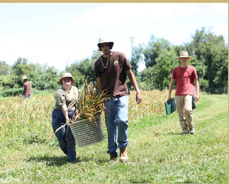
PO Box 968 Clarksburg, MD 20871