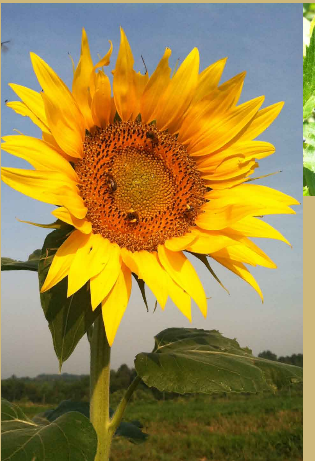
PO Box 968 Clarksburg, MD 20871