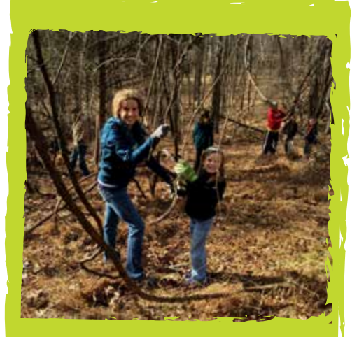
We had ~20 volunteers help remove bittersweet vine, wine berry and barberry from the park during MLK day of service.