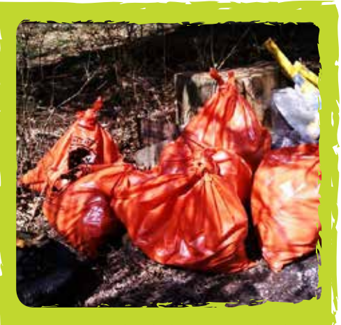
We partnered with the Boys and Girls Club of Frederick to pick up over 15lbs of trash from the park in exchange for treetime.