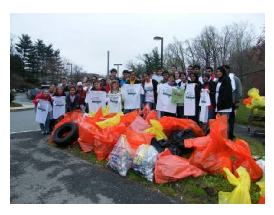
Stream Clean-up Project