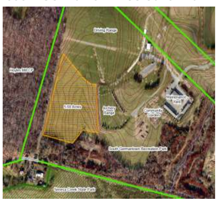
South Germantown Recreation Park