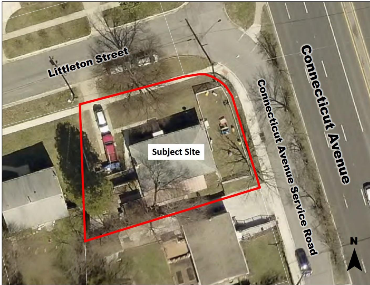
Figure 1: Aerial Photo of Subject Site