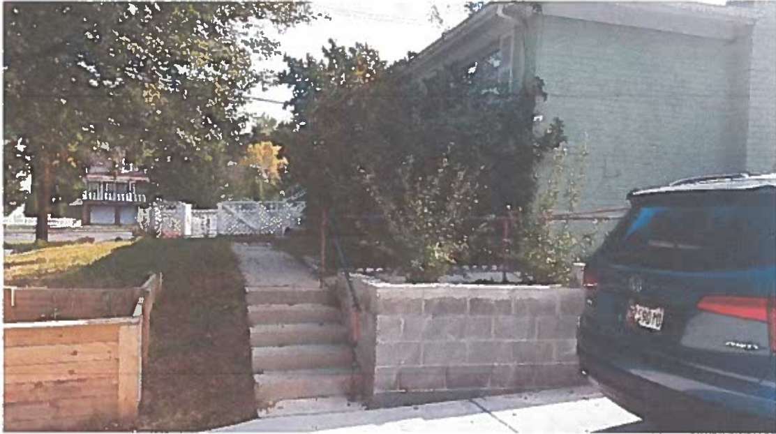
FRONT DOOR (ACCES FOR KIDS AND PARENTS)