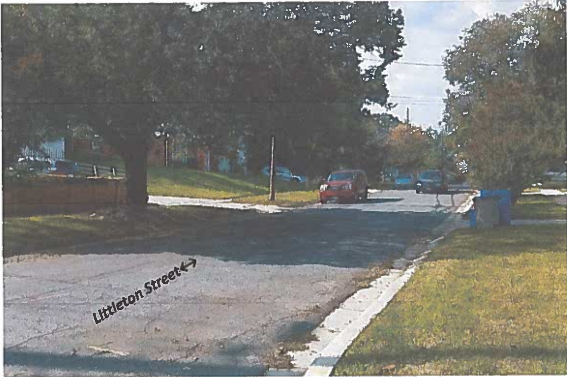
Street parking for employees and parents Littleton Street (above) Connecticut Ave (Below)