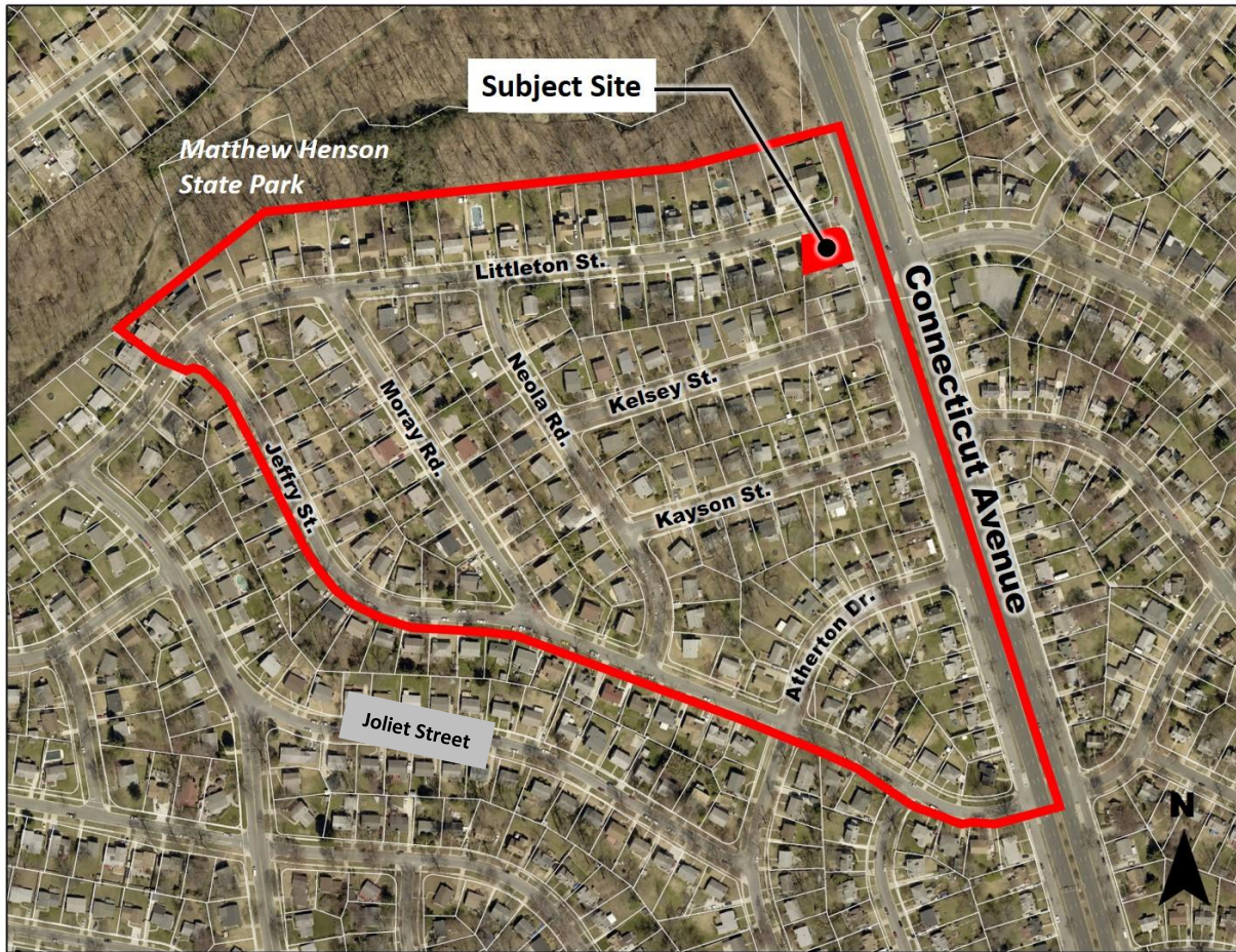
Figure 2 Staff-defined Neighborhood