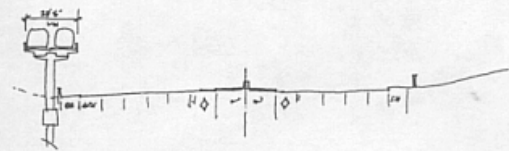
SECTION E-E @ BELTWAY