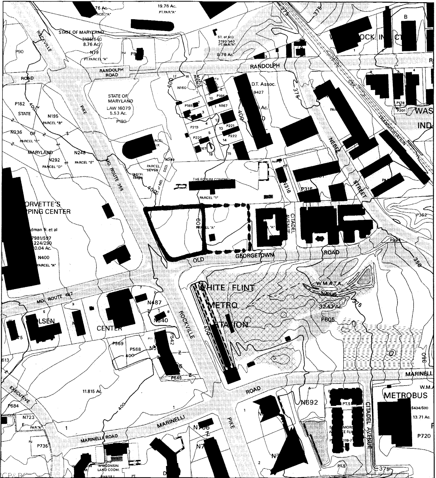
Map compiled on May 21, 2004 at 10:09 AM | Site located on base sheet no - 215NW05