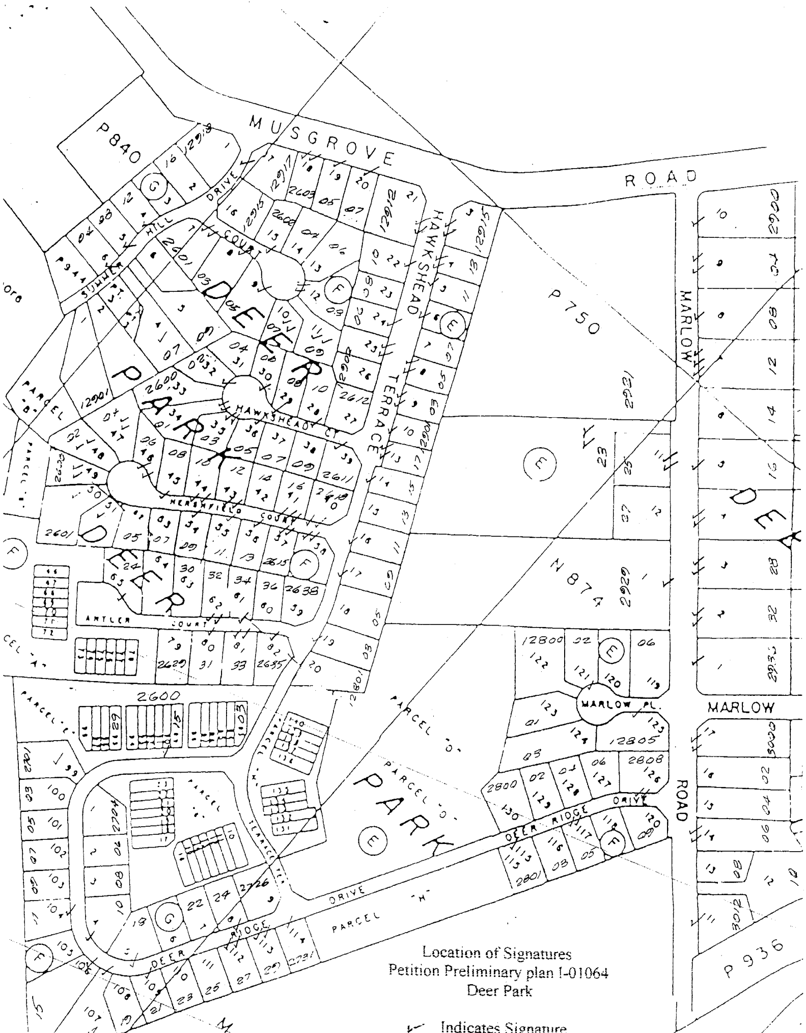
Location of Signatures Petition Preliminary plan I-01064 Deer Park