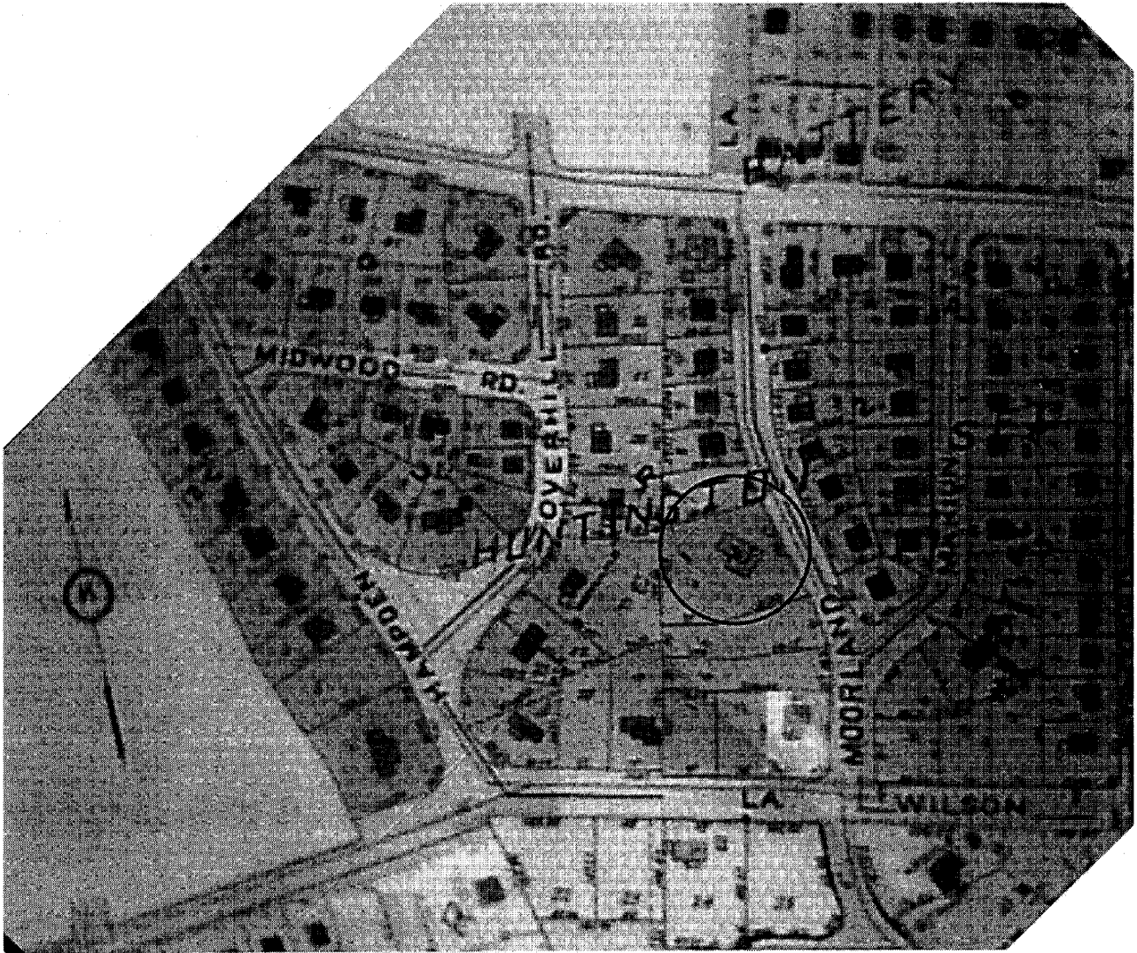
Figure 10. This 1949 map shows the land surrounding Moreland in its present, subdivided state, leaving Moreland on a one-half-acre plot. The earlier private drive has been established as a public road named Moorland Lane, which connects Moreland, shown circled, to the ca.1860s farmhouse at the north end of the lane.

F.H.M. Klinge, Property Atlas of Montgomery County, Maryland (Landsdale, Pennsylvania, 1949), from the Montgomery County Historical Society.