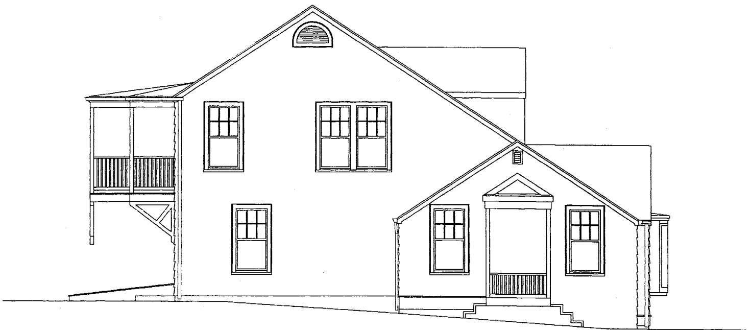
Figure 5. Left (North) Elevation. The projecting bay and portico on the right are part of the 1925 addition. The roofline of the original bungalow was raised in the late 1930's from a 5/12 pitch to an 8/12 pitch to provide more headroom on the second floor. Porch and bump out at left are part of the 1930's renovation as well. Drawing by Jason Gagen, copyright 2004 by Brenneman & Pagenstecher, Inc.