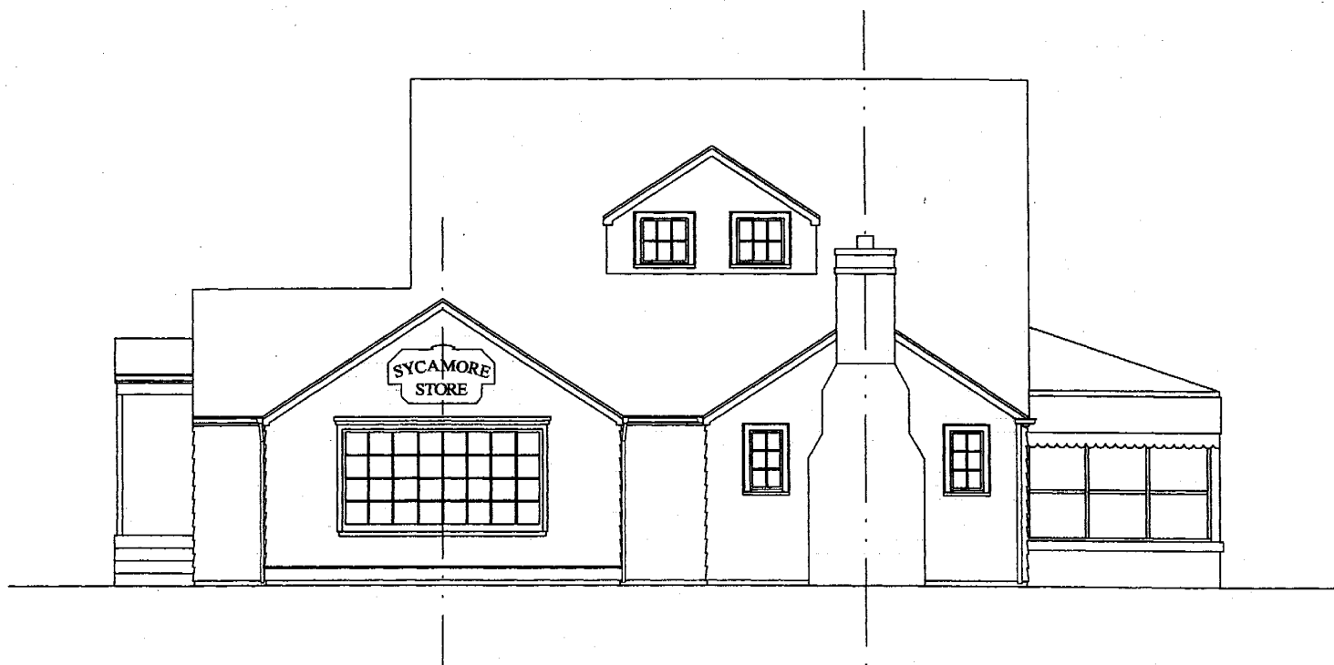
Figure 4. Front (West) Elevation. The two front gables and the porches to either side are all additions from 1925. Note the dormer in the roof of the original bungalow, behind. Drawing by Jason Gagen, copyright 2004 by Brenneman & Pagenstecher, Inc.