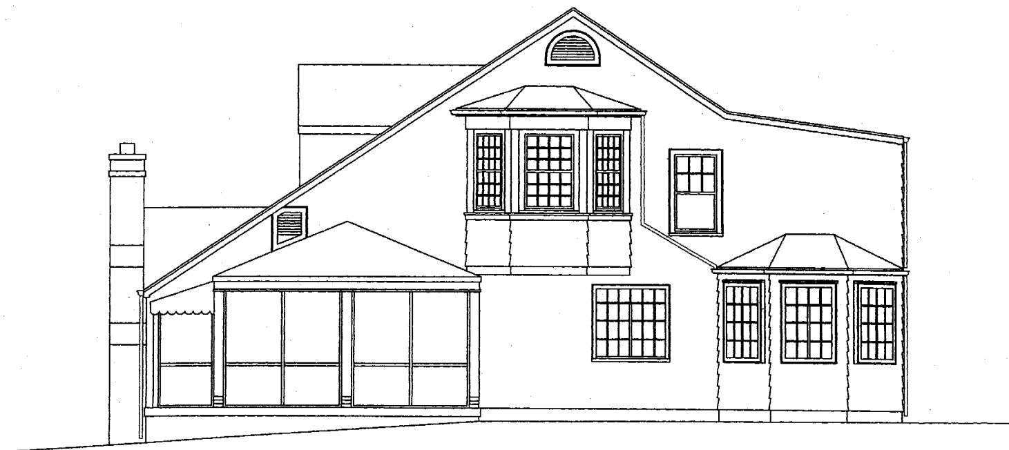
Figure 7. Right (South) Elevation. Both bays are additions from the 1930's. Drawing by Jason Gagen, copyright 2004 by Brenneman & Pagenstecher, Inc.