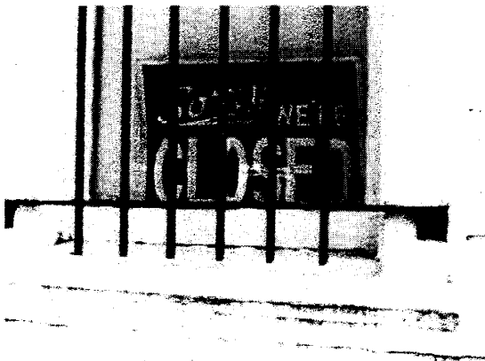
Figure 12. The Sycamore Store, closed for business. Photo, courtesy of the Sycamore Islander newsletter, 1999