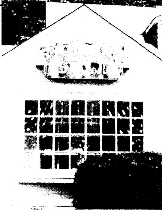
Figure 11. The Sycamore Store sign and storefront bow window, a local landmark. Photo, courtesy of the Sycamore Islander newsletter, 1999