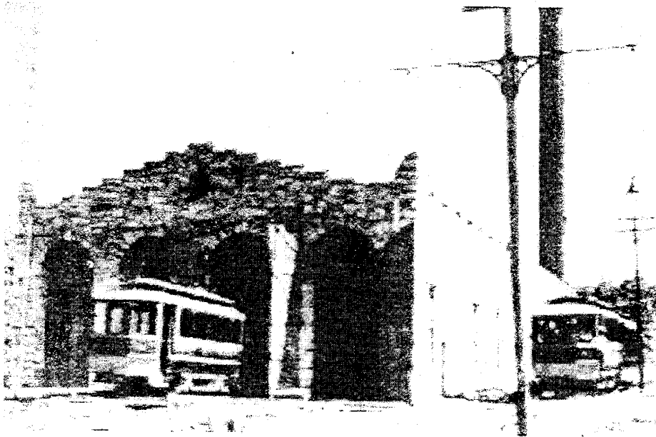
The Glen Echo Railroad barn and powerhouse

Figure 13. Across Walhonding Road from the Sycamore store stood the car-barn and powerhouse for the Glen Echo Electric Railway, shown here circa 1891-1900. Its vandalized walls lasted well into the 1960's, and large stones in yards throughout the area came from its remains.