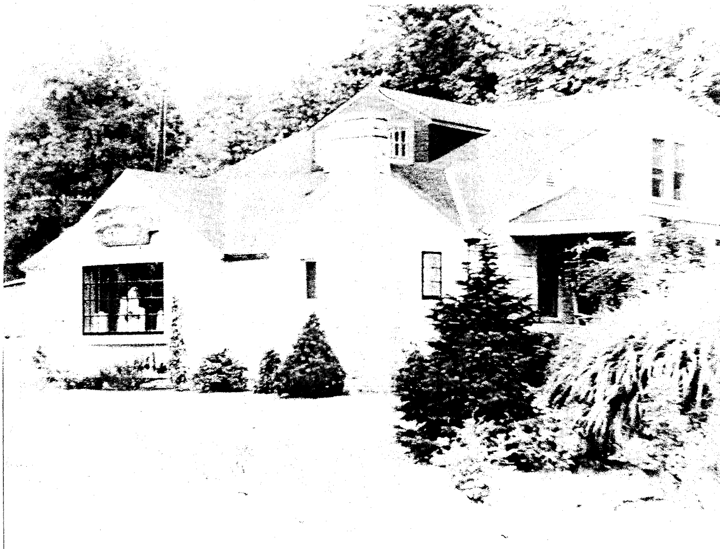
Figure 20. Another view, in summer, from about the same time as the photo above. Note the dark painted window sashes and copper Gutters and downspouts. This photo makes it clear that the front addition was built later than the main body of the bungalow (look at the roof pitches and the deterioration of the original shingles. Also note the shed in the background left, on the far side of Walhonding Road, where the ravine is now.