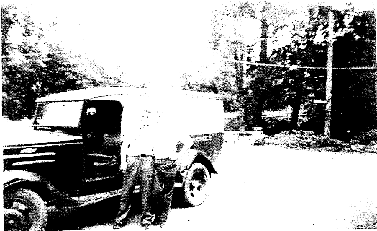
Figure 22. A young George Rogers and the Holmes Bread delivery man, posing in front of the Store, on a normal delivery day, with their back to the intersection of MacArthur Boulevard and Walhonding Road.