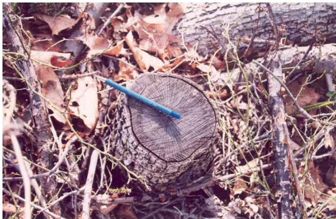
Figure1. A 45 year old stunted oak tree stump

Montgomery County's Serpentine Oaks appears to have remained forested since at least 1940 based on review of aerial photography and study of dendrology ring counts, indicating a varied ecological condition from the a classic Barrens. Once cleared, "Barrens" in part due to the lack of nutrients in the soil and the presence of minerals at levels toxic to plant growth, tend not to experience normal forest regeneration. Serpentinite soils typically stunt plant growth producing a somewhat miniaturized forest effect.