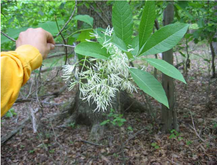
Figure 4. Fringe Tree in flower at Serpentine Oaks Conservation Park

The east unit is entirely on the east side of Piney MeetingHouse Road. This acreage was dedicated to M-NCPPC as part of the approval of Site Plan 8-04020 (Potomac Preserve). The majority of this section is within environmental buffer, including 100-year floodplain. Entirely forested, no formal development is proposed. Access from Piney Meetinghouse Road to Tanager Lane is recommended via an existing natural surface trail. This trail provides access for surrounding developments to the east to access the North Unit. Bollards at the end of Tanager Lane are recommended to help limit the potential for dumping or illegal access. This area will be monitored for potential future use.