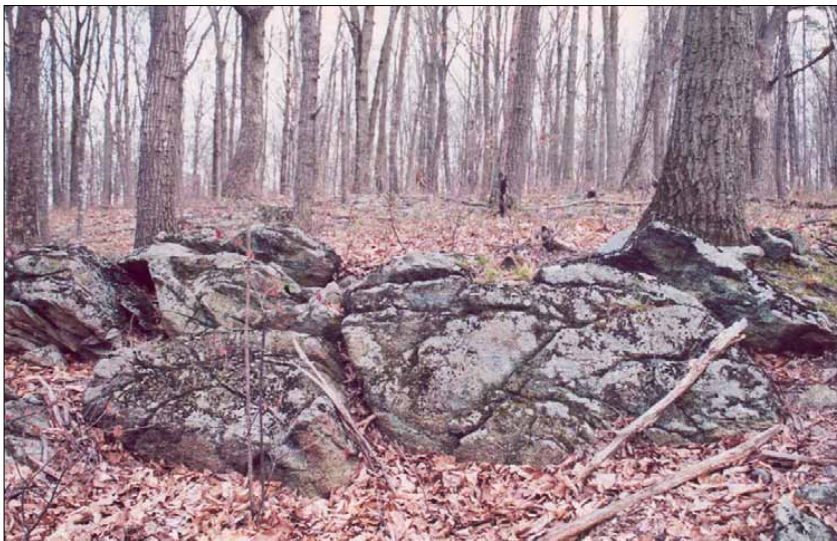
Figure 2. Serpentine Rock Outcrop

In addition to birds, the park is home to a wide diversity of terrestrial wildlife species including at least 14 species of mammals, 6 reptiles, and 11 amphibians. Mammals include common species such as red fox, white-tailed deer and gray squirrel, as well as less common species such as eastern coyote. Many signs of a high deer population were observed in the park including reduced forest understory density and regeneration and negative impacts to the health of several RTEW species. Reptiles include most of the common species of the County as well as the less common eastern hognose snake and five lined skink. Wetlands and vernal pools provide breeding habitat for the spotted salamanders, marbled salamanders, wood frogs, spring peepers and other amphibians. The State rare buckmoth also occurs within the forest interior.