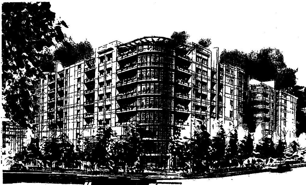
CORNER OF WISCONSIN AVENUE AND BATTERY LANE

Three separate 9-story glass and steel building elements frame the public plaza. Each has a separate entrance from an adjacent street. The largest building component, fronting along Battery Lane, has the main lobby of the complex and the more public of the interior areas, such as the party room. A two-car drop-off and an entrance to the parking garage are provided along Battery Lane. Approximately 120 feet north from the corner of Wisconsin Avenue and Battery Lane is the 60-foot wide opening to the public plaza. This is an accessible, at-grade entrance leading through a landscaped and paved open space framed by the three buildings. The arts incubator space is located at the plaza and Wisconsin Avenue and will open out onto the plaza. The two northern residential building elements frame a fifty-foot wide public space with a view north to the NIH green space. A series of landscaped spaces and steps lead west down to Woodmont Avenue.