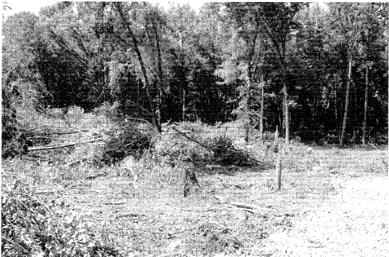
Close-up of green foliage still on downed trees.