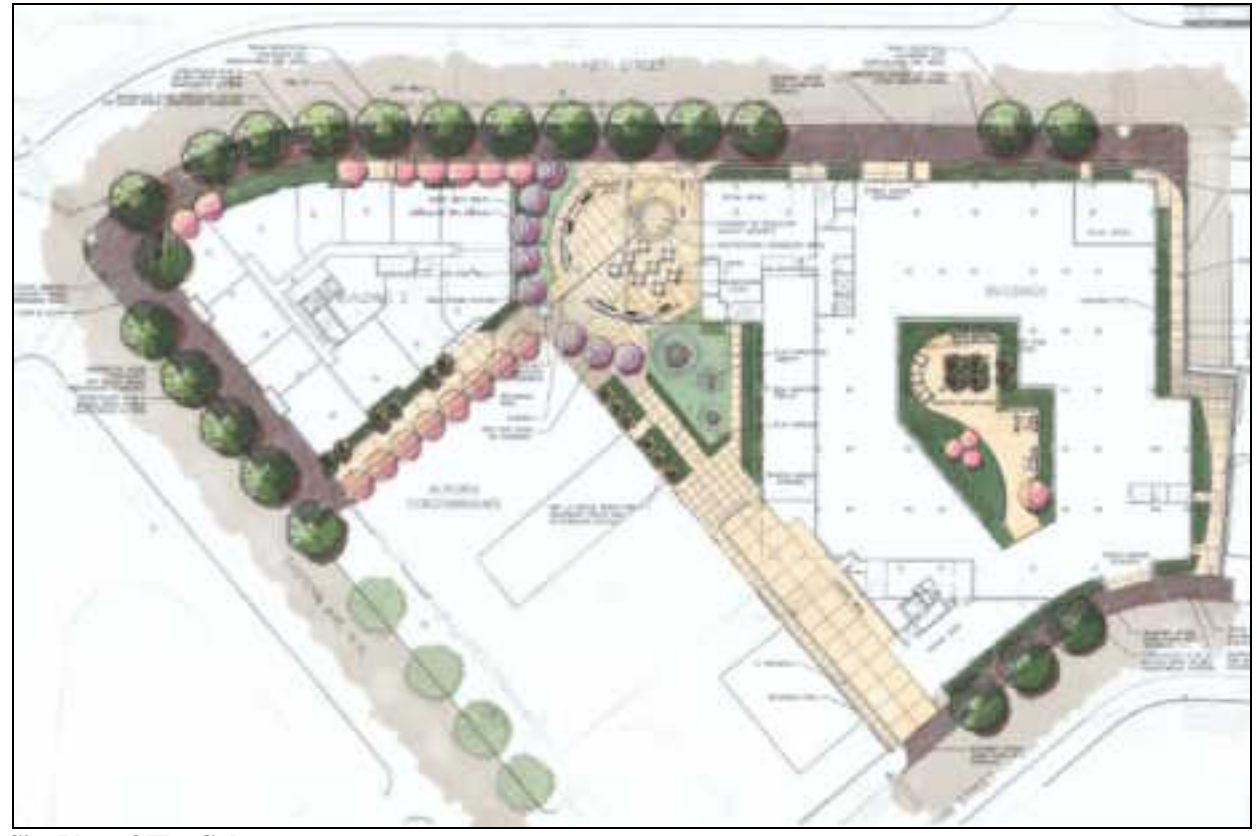
Site Plan of The Galaxy

Pursuant to the original Site Plan approval, the Applicant was entitled to develop the property with a maximum of 321 multi-family residential units (including 41 MPDUs) in three buildings up to 125 feet in height and an associated on-site parking structure containing a maximum of 200 public parking spaces and 449 private parking spaces. Due to current market conditions, the Applicant now seeks to modify these existing entitlements to allow the development of a 2.26 FAR mixed-use project that is smaller in scale and obtains a maximum height of 75 feet. The proposed project provides: a maximum of 241 multi-family residential units, including 31 MPDUs (12.5 percent) in two buildings; 3,663 square feet of street-level retail space; and a parking garage with 160 public parking spaces and 274 private parking spaces. Overall, there is a 25 percent reduction in the number of dwelling units proposed and only a 2 percent reduction in the public use space and amenity proposed with this Amendment.