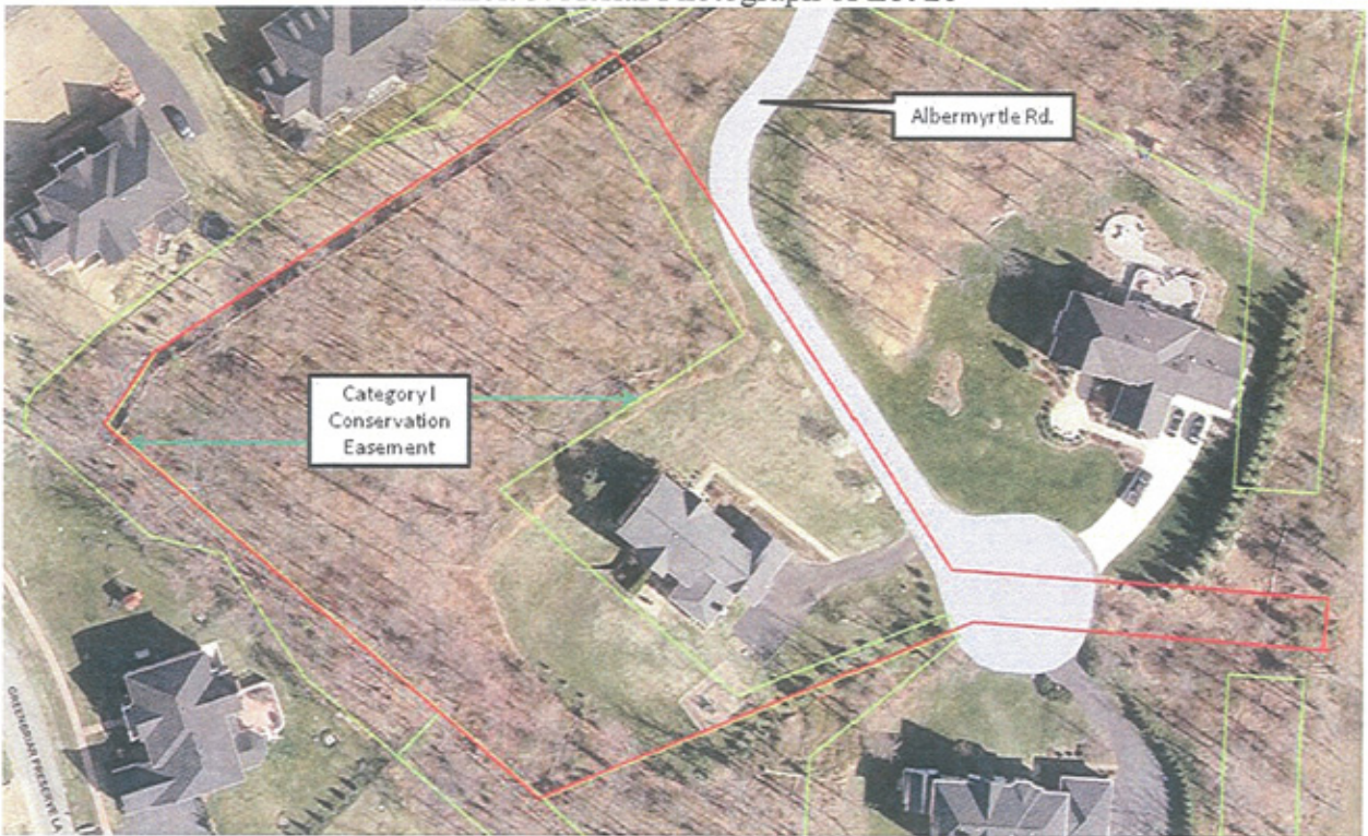
Exhibit 3: Aerial Photograph of Lot 20

Red Line = Property Line Green Line = Cat I easement