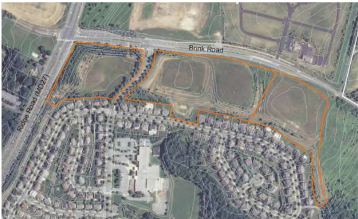
Figure 1: 2009 Aerial Photograph of Site

The site is located high on the landscape of the Great Seneca Creek watershed (Use I waters). Apart from a stormwater management facility on the south side of the park there are no stream or wetland features on this site. A 2.19 acre area of forest, which was planted as part of a previous development plan, exists on the northwest corner of the site.