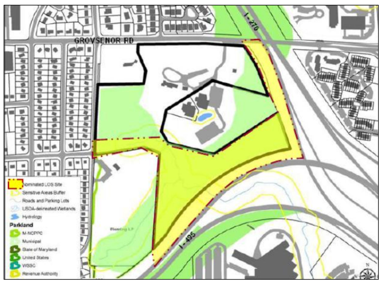
Legacy Open Space Area

The Applicant proposes to dedicate 11.35 acres as an extension of existing Fleming Local Park. This dedication is largely consistent with the LOS Master Plan designation. Staff determined a narrow area of LOS designated forest parallel to Interstate 270 to be more appropriate for conservation easement as opposed to park dedication due to maintenance and policing issues if the Department of Parks owned such a narrow corridor fronting one-family attached units and the Interstate system. Therefore, that area will be retained on private property and will be preserved and maintained in a Category I Conservation Easement.